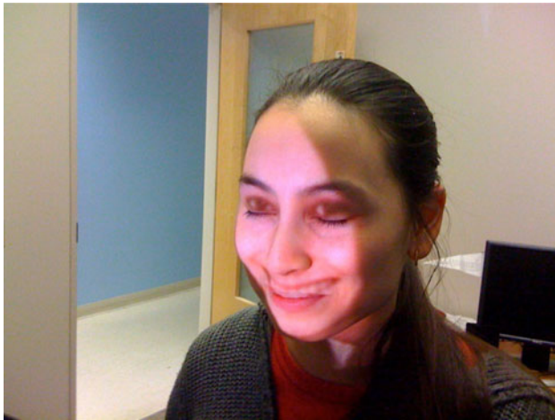
Fig. 3 Projected face (eyes open, smiling) on real face (eyes and mouth closed)

onto his manager's back: "Everybody was laughing. And then I hid [the projection] and said, 'So were your ears burning?'. everybody was snickering in the background. It was quite comical."