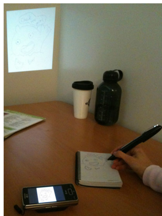
Fig. 2 Projecting while using UbiSketch. Phone screen and projected display show digitized version of paper sketch