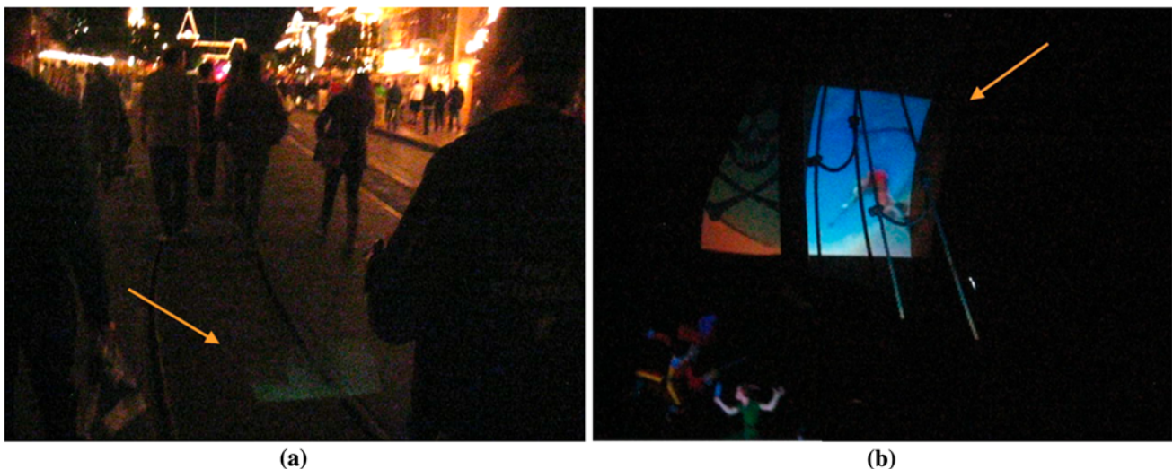
Fig. 4 Projecting at Disneyland while walking on Main Street USA, and riding on Peter Pan's Flight

He described one incident in which he projected a video of Peter